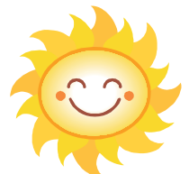
AND MANY OTHERS!